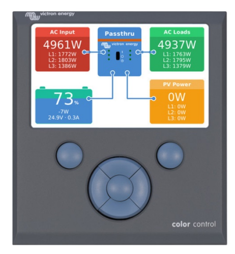
Color Control Panel, showing a PV application

When connected to the Ethernet, systems with a Color Control panel can be accessed remotely and settings can be changed.