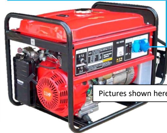
Generator Input OR Mains input