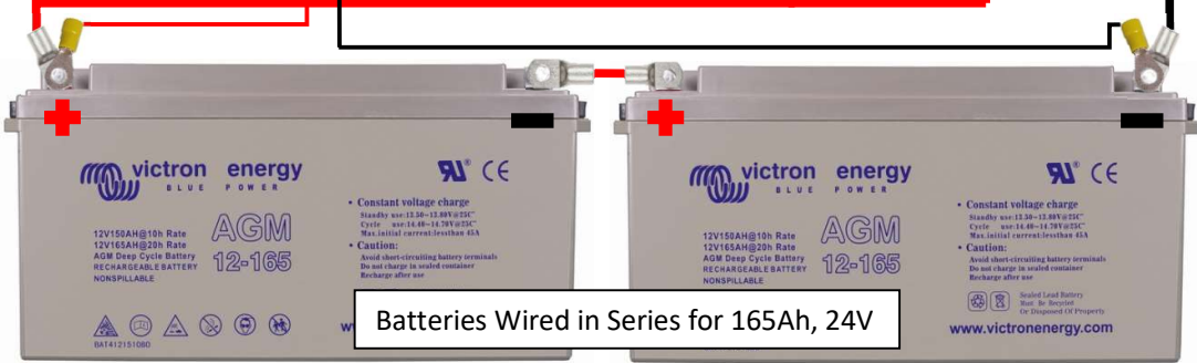
Batteries Wired in Series for 165Ah, 24V

AC Loads up to 1280W. More if a generator is connected as the MultiPlus will feed through the power